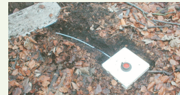
Fig. 1: Installation of a suction plate below the organic layer (Location: Bochum-Langendreer).

For clarification of this question newly developed suction plates made of plastics have been installed into the upper soil of two urban forests in Bochum (Fig. 1). From december 2002 until november 2003 seepage water was extracted weekly from the organic layer by vacuum (constantly 250-300 hPa). The materials of the innovative suction plates with their high hydraulic conductivity and their low heavy metal adsorption should combine advantageous physical and chemical characteristics to get quantitative statements of the seepage water consistency.